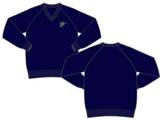
Navy Blue Jumpers (optional)