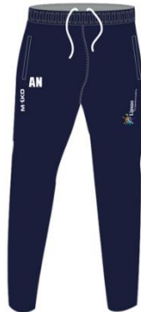
PE Track bottoms