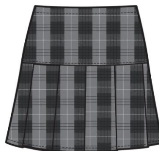
Skirt - Lipson Tartan