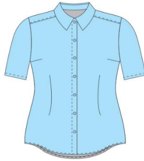
Light blue shirts – straight or fitted