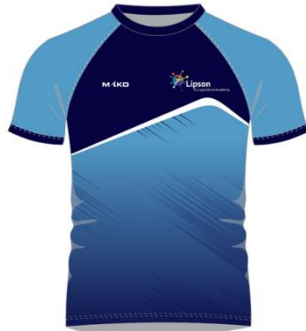
PE Top – Branded