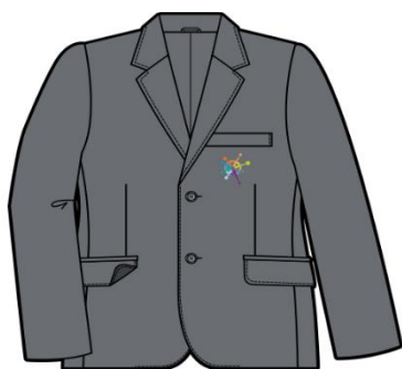
Blazer – Branded with logo

The following items are expected to be worn as uniform (branded items highlighted, all other items are acceptable as unbranded and generic but in the same colour and style):