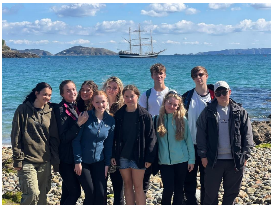
Sept 24 Crew with Pelican of London in Guernsey